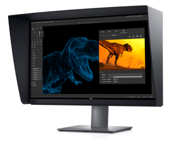
DELL ULTRASHARP 27 4K PREMIERCOLOR MONITOR WITH A HOOD | UP2720Q

3Dconnexion's patented 6-Degrees-of-Freedom (6DoF) sensor is specifically designed to manipulate digital content or camera positions in the industry-leading CAD applications. Simply push, pull, twist or tilt the 3Dconnexion controller cap to intuitively pan, zoom and rotate your 3D drawing.