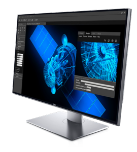
DELL ULTRASHARP 32 8K MONITOR | UP3218K

*CalMAN license required, sold separately