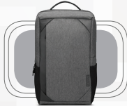
Lenovo 15.6" Laptop Urban Backpack B530