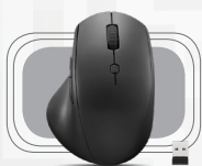
Lenovo 600 Bluetooth® Silent Mouse